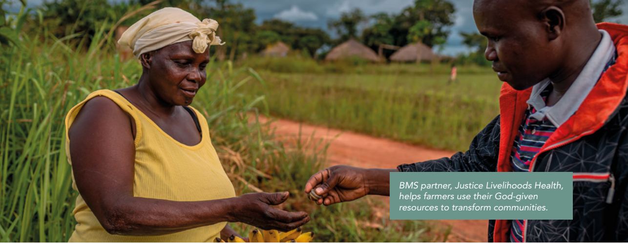
BMS partner, Justice Livelihoods Health, helps farmers use their God-given resources to transform communities.