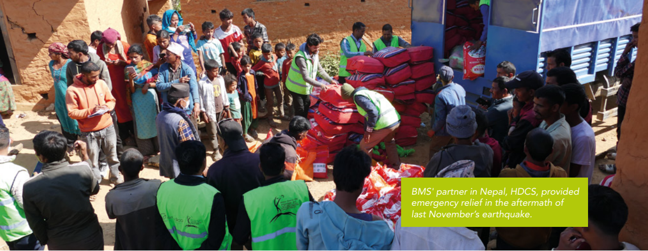
BMS' partner in Nepal, HDCS, provided emergency relief in the aftermath of last November's earthquake.