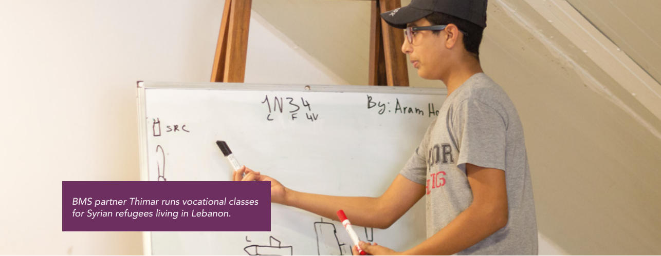
BMS partner Thimar runs vocational classes for Syrian refugees living in Lebanon.