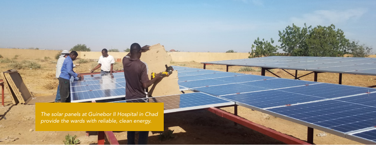
The solar panels at Guinebor II Hospital in Chad provide the wards with reliable, clean energy.