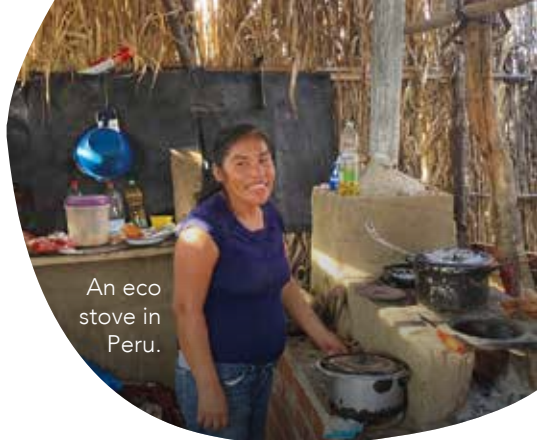
An eco stove in Peru.

were distributed to 100 smallholder farming families in Uganda